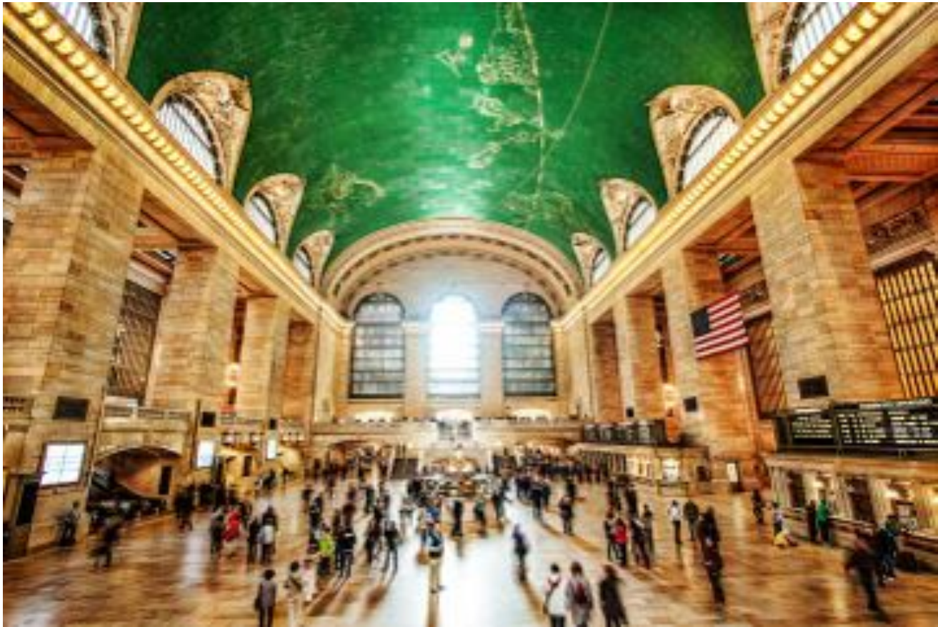
Grand Central Station:

25A Magazine expanded its reach westward to one of America's greatest and historic cities. New York City is steaming with the rich history of the most famous businessmen such as Andrew Carnegie, John D. Rockefeller, and Cornelius Vanderbilt. The world trade center, the financial district, continues to flourish as one of the most visited iconic locations.