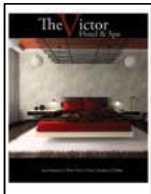
Full Page Non Bleed