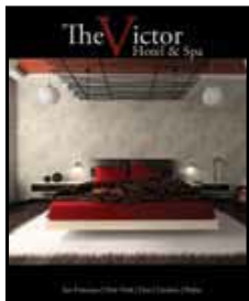
Full Page Bleed